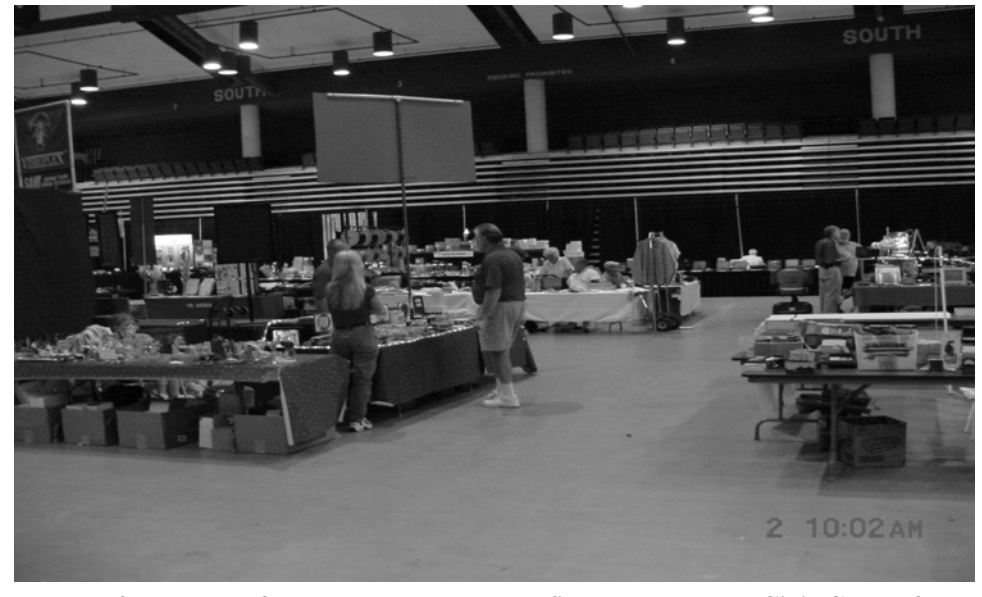
Plenty of space, overflow crowds and vendors filled the Manatee Civic Center for the 26th annual Tampa Bay Hamfest last December.

Amateur radio exams were administered to nearly 50 people at three