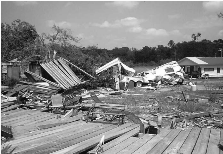
Your property ends up like this, call Ken WA9WCP and FEMA will get to work for you.